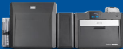
Dual-sided printer/encoder with optional lamination

A flexible, modular system that can grow with your needs.